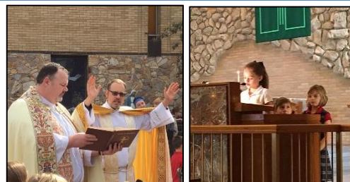
Left: Blessing Pets on the feast of St. Francis of Assisi Right: 1 st Grade students lead School Mass