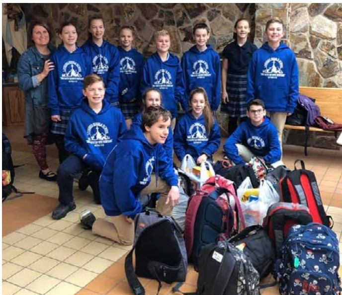
7th Graders help load up back school bags with snacks for Backpacks and Snacks.