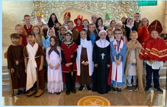
3rd Graders celebrate All Saints Day!