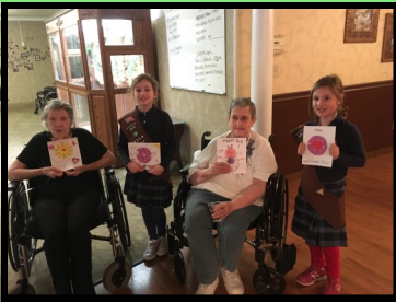
The Brownies made and delivered Valentines to the Bettendorf Healthcare Center

http://www.jostens.com/apps/store/customer/1898600/Lourdes-Catholic-School/