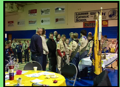
5th Grade Cub Scouts bridged up to Boy Scouts