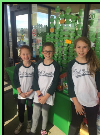
Everyone's favorite time of year - Girl Scout cookies are here!