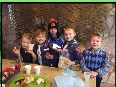
Cub Scouts served for Do-nut Sunday