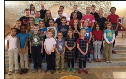
Recipients of Fruit of the Spirit award -Peace.

Isn't that what we all want to hear about our children and students? Throughout the school year at LCS, teachers can catch students doing good acts based on the Fruits of the Spirit in Galatians 5:22-23. We focus on a different "fruit" every month, including Love, Joy, Peace, Patience, Kindness, Goodness, Faithfulness, Gentleness and Self-Control. The students even nominate teachers and staff too. Every month, 20+ students and teachers are recognized. This is just one program at Lourdes that makes our school a caring and nurturing environment.