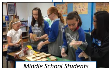
Middle School Students make Sandwiches for St. Anthony Service Project.

"Lourdes has become such a great family community for our family. We have proud parent moments all year long even when the students are not even our children. Such a great culture for faith and learning."